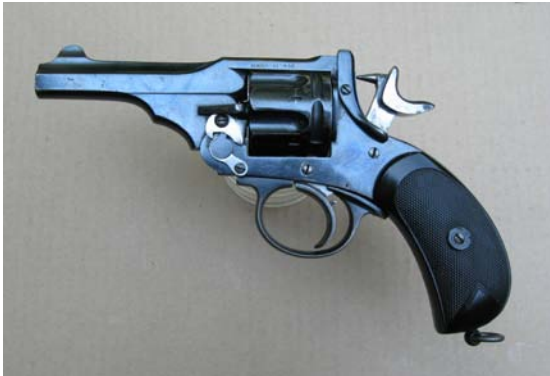
Image 3 Webley Mark III