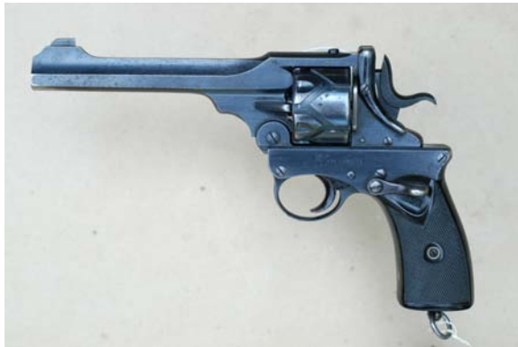
Image 15 Webley Fosbery