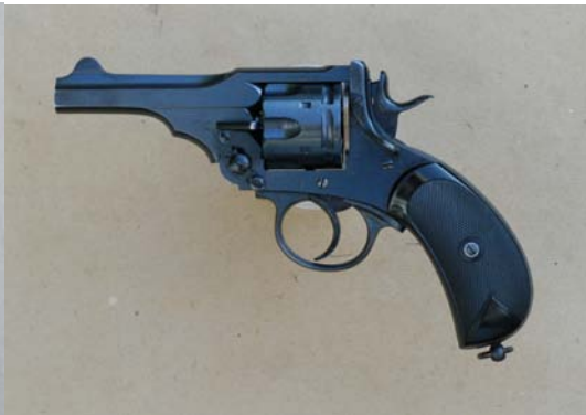
Image 4 Webley Mark IV