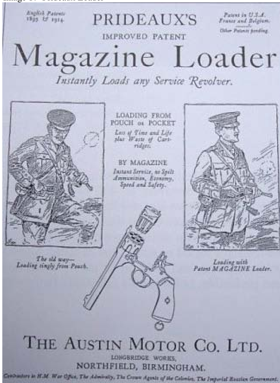
Image 17 Prideaux Loader