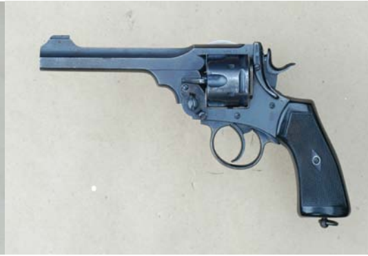
Image 8 Webley Mark VI