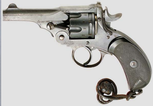
Image 2 Webley Mark II