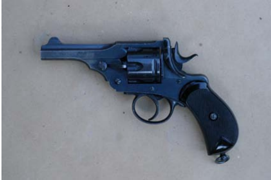
Image 1 Webley Mark I