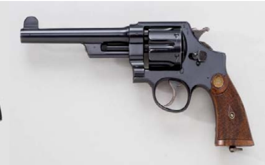
Image 10 S&W Mark I