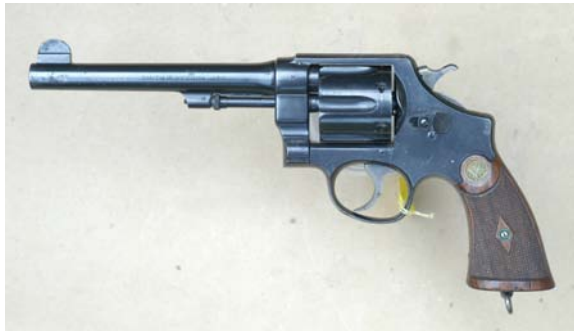
Image 11 S & W Mark 2