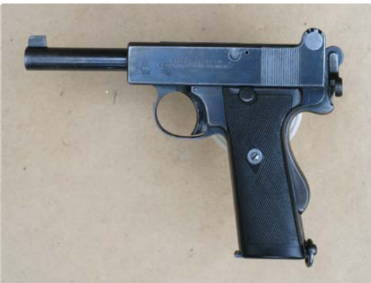
Image 6 Webley RHA