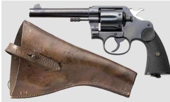
Image 9 Colt New Service