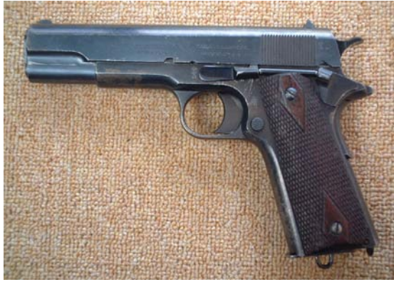
Image 13 Colt GM .455