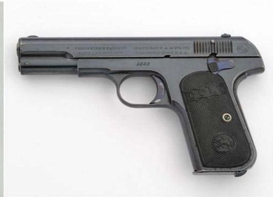
Image 16 Colt 1903 Pocket pistol