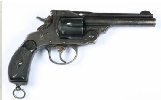
Image 12 Pistol OP